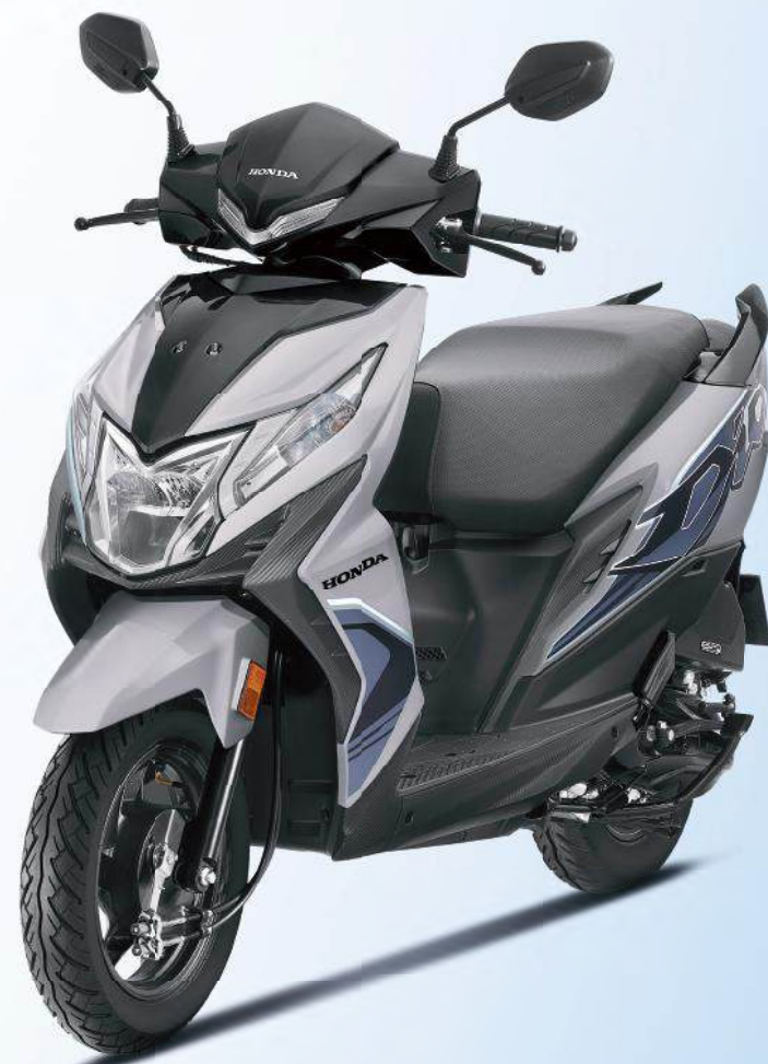
PEARL IGNEOUS BLACK + PEARL DEEP GROUND GRAY